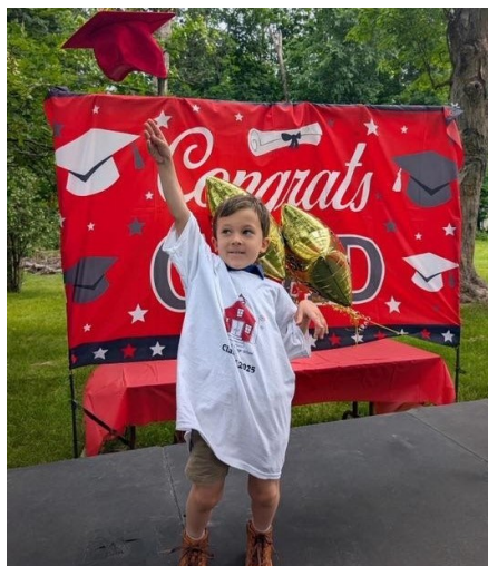
Someone is happy!