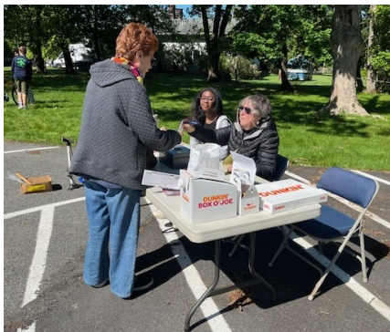
A bike donor is at the registration table.