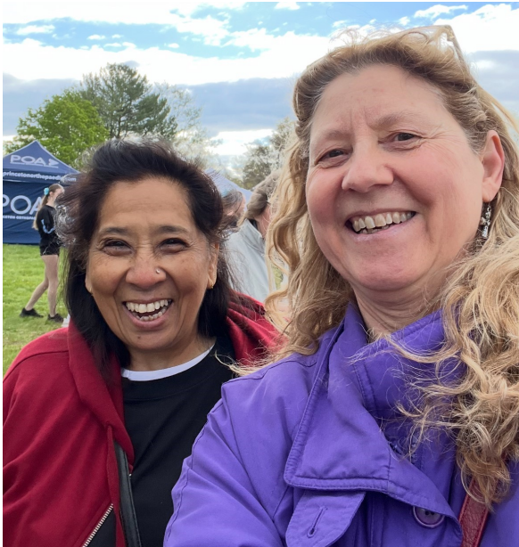
Two beautiful smiles from two beautiful ladies!