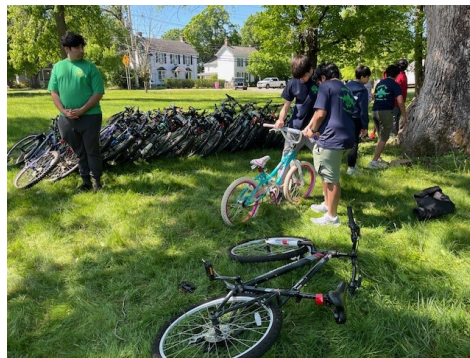
About 104 bikes were donated.