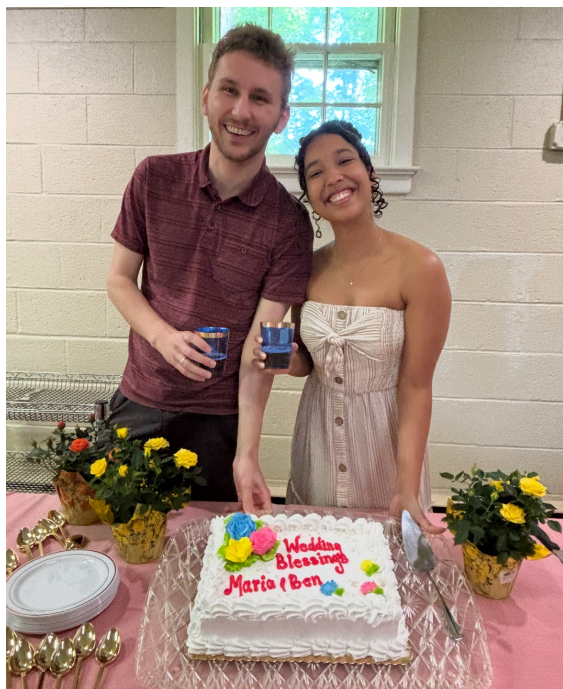
The happy (and beautiful) husband and wife-to-be