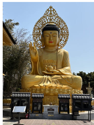
Yaksa-Yeorae is the medicine Buddha. People go to her to be healed.