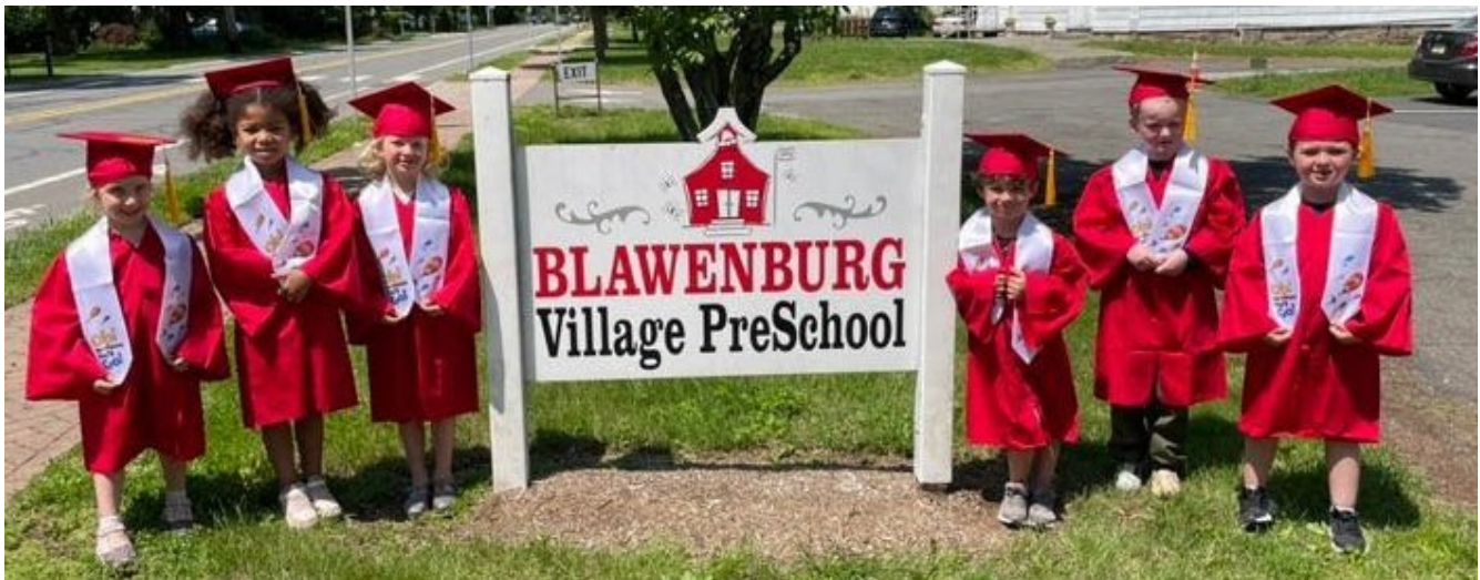
Kindergarten Class of 2025