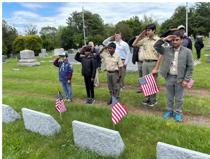
The scouts and their leaders pay their respects.