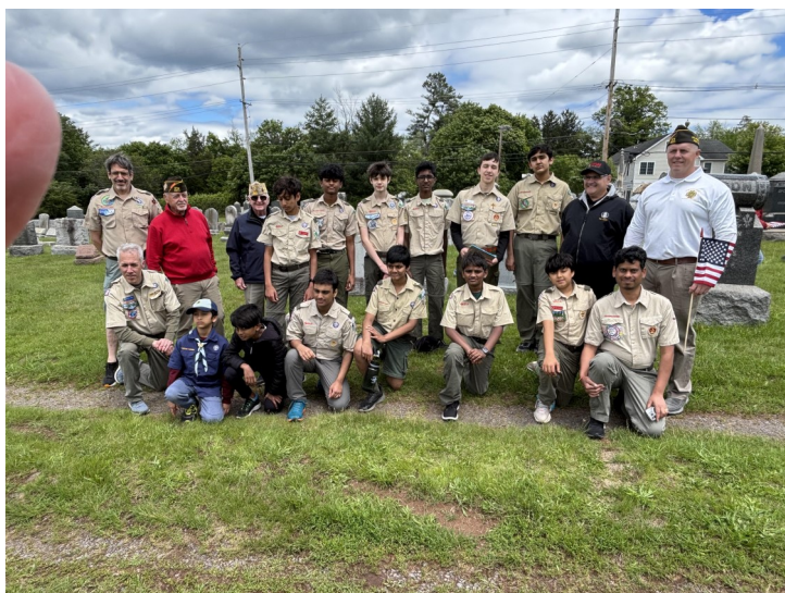
The scouts, their leaders, and members of the VFW.

Here at BRC, we very much appreciate the service of the honored soldiers, the men of the VFW, and the work of our sponsored Boy Scout Troop #46. Also, thanks to our Cemetery Team for arranging to have this done and for taking pictures.