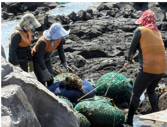
The Haenyeo, the diving women of Jeju Island, are looking for shellfish, seaweed, and other seafood.