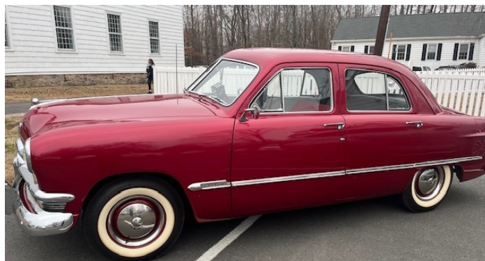
Don's beloved '50 Ford