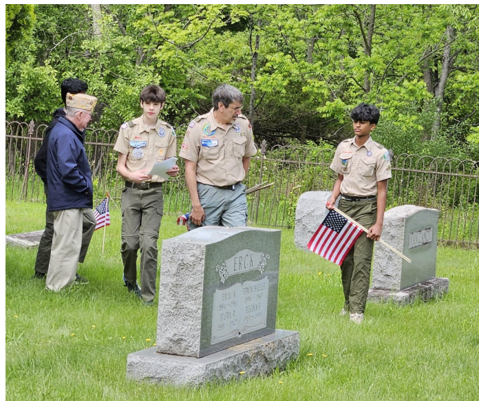
The veterans gave the scouts very specific instructions concerning the placement of the flags.