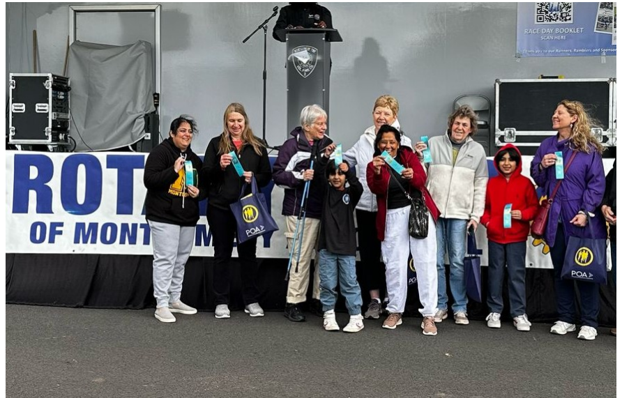
We won the "Community Spirit" award.