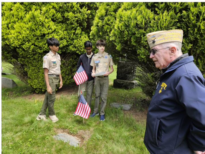
This former soldier is looking at the grave of a fellow veteran.