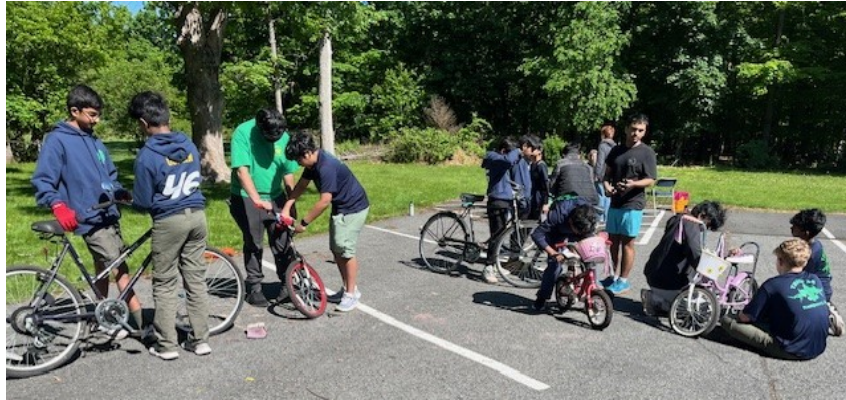
Scouts at work dismantling bikes for shipment

This year the bikes are destined for Sierra Leone and Madagascar.