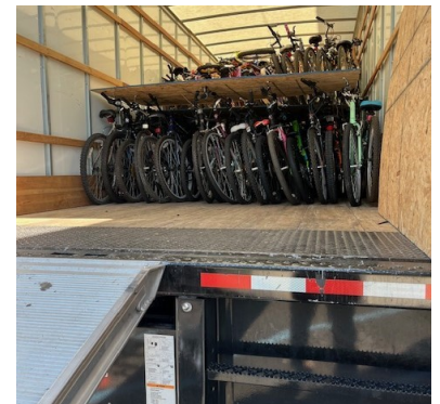
These bikes are loaded on the truck for the first leg of the trip.